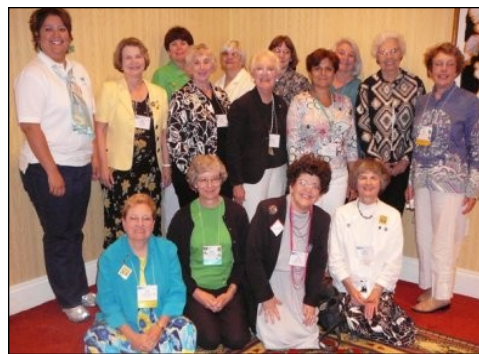
2009 AAUW-NM National Convention Attendees