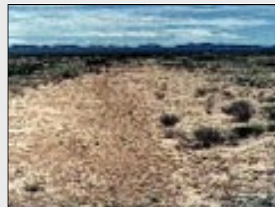
Aerial photo of El Camino Real, near Radium Springs, NM

Please watch for additional details in the Winter Roadrunner .