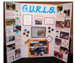
"GURLS" project display