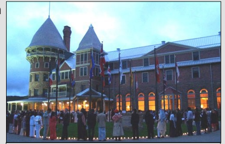
United World College Reception

For those requiring accommodations for Friday, July 22 and Saturday, July 23, the Plaza Hotel in the historic center of Las Vegas is the host hotel for this meeting. The room rates and reservation information are as follows: