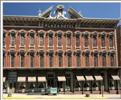
Historic Plaza Hotel, Las Vegas, NM