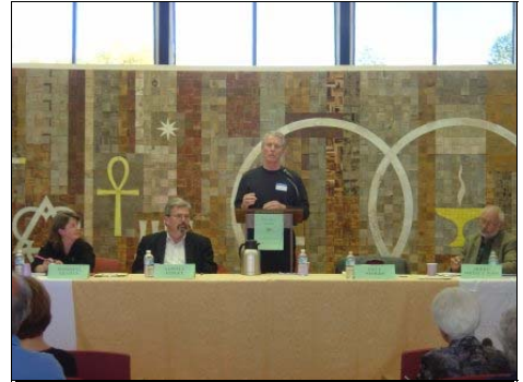
West Mesa Branch Election Forum, November 12, 2005

Please submit your application, by mail, fax, or email, to all four of the following: