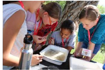
F Field Trip