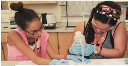
Working with heart pump