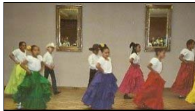
Young folklorico dancers in traditional costumes