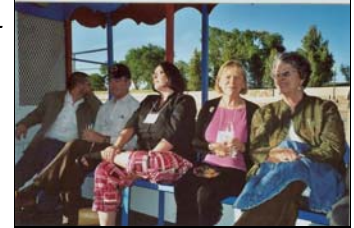
Enjoying a boat ride on the Pecos