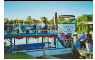
The George Washington paddle-wheeler

From April 28 through April 30, we pondered public policy at the annual state convention in Carlsbad. The speakers were excellent, food was wonderful (particularly our gourmet Saturday buffet, which was OUTSTANDING), and the business handled efficiently. Even the weather cooperated by providing a beautiful evening for a boat ride and dinner on the Pecos River.