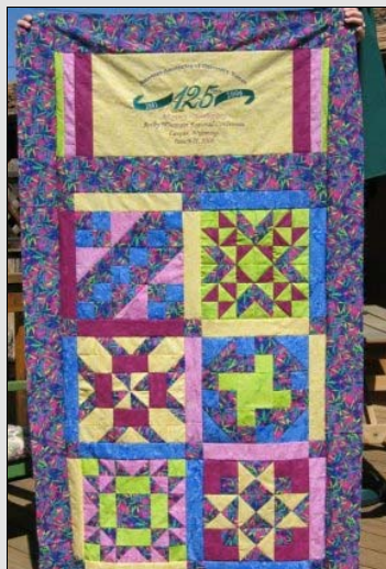
Rocky Mountain Regional Commemorative Quilt