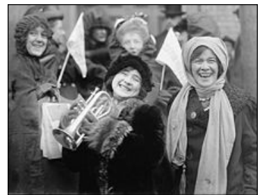
U.S. women suffragists demonstrate for the right to vote in February, 1913.

August 26, 2010 marks the 90th anniversary of the 19th Amendment to the U.S. Constitution— the amendment that finally gave American women the right to vote and to hold public office. In honor of this occasion, the Las Cruces branch is co-sponsoring a celebration with the Las Cruces branch of the League of Women Voters (LWV) and many additional women's organizations throughout the Las Cruces/El Paso, Texas area. This is an unprecedented collaborative event for our area, and has provided an opportunity for women of diverse ages, backgrounds, and political beliefs to unite for a common cause.