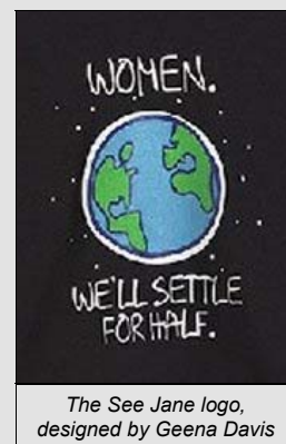
The See Jane logo, designed by Geena Davis

Please visit the See Jane website ( www.seejane.org ) for additional information on this study, the Dads and Daughters program, and the See Jane program. These are important participants in the cause of advancing media equality for women and girls.