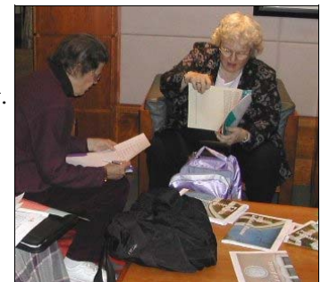
AAUW-NM members review lobbying materials before meeting with legislators.

AAUW-NM Legislative Day was informative for both legislators and members. We feel we were effective in promoting our issues to our elected representatives. We invite all members to attend the 2007 Legislative Day and witness our government in action.