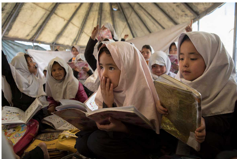
Tent School in Kabul