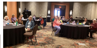
Members listen attentively and ponder the future of AAUW-NM